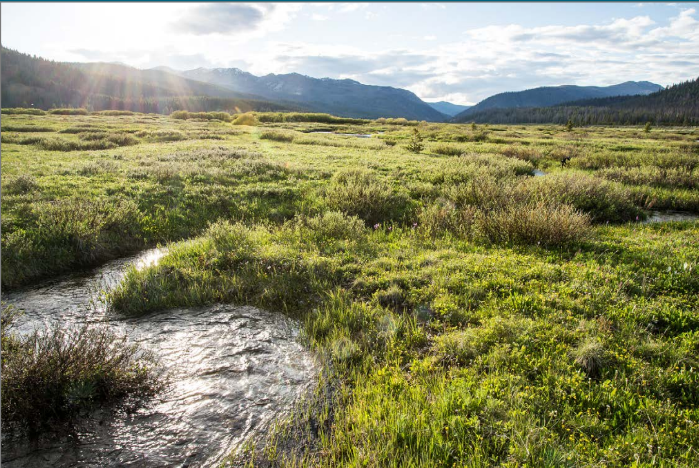
Salmon River, Oregon.

Cover: Project partners wading through the Finn Rock Reach Project, Mckenzie River, Oregon.