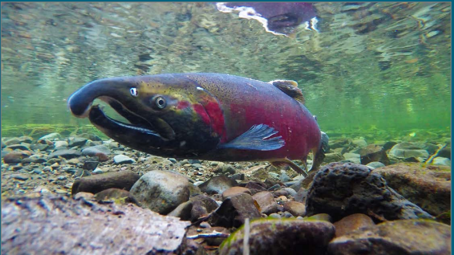
Spawning coho salmon, in Salmon River, Oregon.