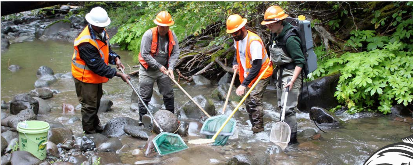
Left: Fish Relocation, Phase 1 Deer Creek project.